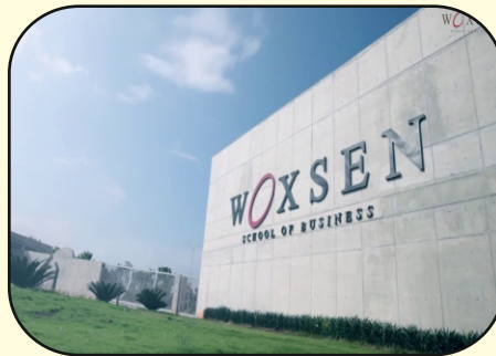
Woxsen School of Business