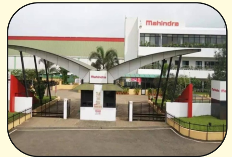
Mahindra Tractor Unit